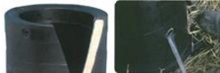
H 1000 mm: Model designed for cattle, in new buildings.