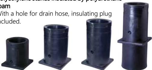
H 400 mm: Model especially designed for little animals: calves, sheeps, Non-contractual goats, ponies

With a hole for drain hose, insulating plug included.