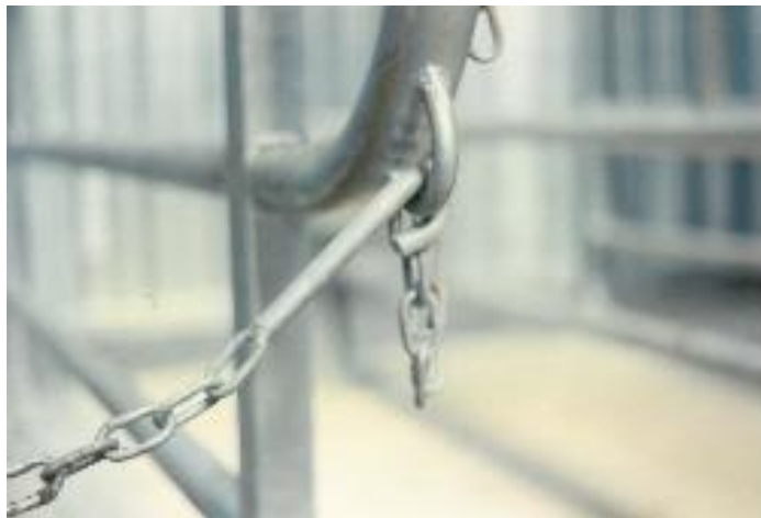
REAR CHAIN WITH HANDFUL HOOK